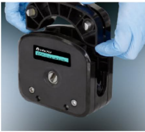
A. Lift both side levers, take off the upper block.