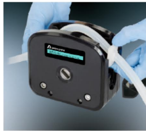
B. Put the tubing with cartridge or connector into pump housing.