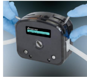
C. Install the upper block, put down the levers to lock the block.