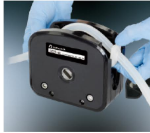
B. Put the tubing with cartridge or connector into pump housing.