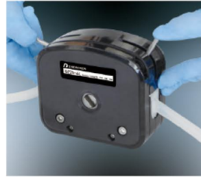
C. Install the upper block, put down the levers to lock the block.