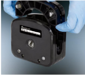
A. Lift both side levers, take off the upper block.