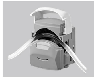
3. Put the tubing into the pump head.