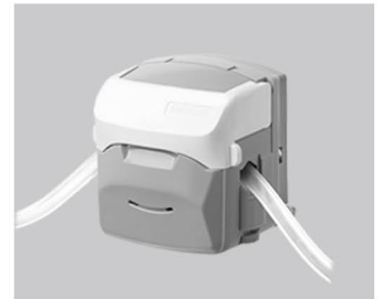
4. Close the flip top of the pump head downward to complete the installation.