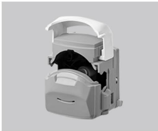
1. Lift the flip top of the pump head to open the pump head.