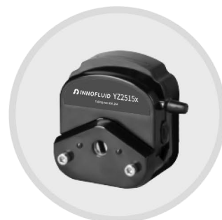
EasyPump Pump Head