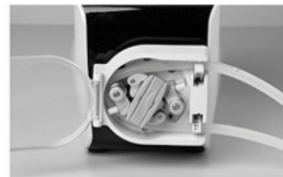
3. Press the pipe clamp, put the tube into the U shaped groove.