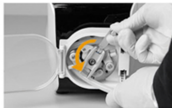
2. Put the tube between the two guide posts. Hold the spanner, rotate the wheel body.