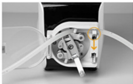
1. Press the pipe clamp, put the tube into the U shaped groove.