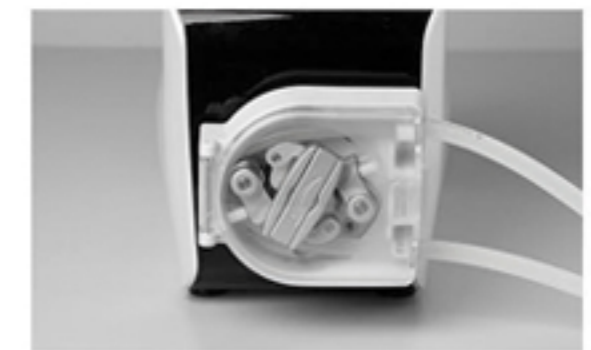
4. Installation is finished.